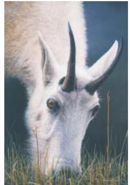
Rocky Mountain Eye II

For additional information: (843) 723-1748 www.sewe.com