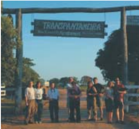
Group entering the Pantanal

The itinerary was designed to introduce visitors to a few of this vast country's highlights, giving them a taste of its diversity and natural beauty. The weather could not have been more perfect, the food was wonderful, and the group seemed to have truly enjoyed themselves. Some of the comments overheard during the trip included: "this, right here, is the most beautiful thing I have ever seen;"