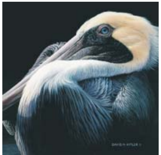
Pelican Up Close

Join us to celebrate SEWE's 25th Anniversary! SEWE is the largest wildlife art and nature event in North America, featuring original paintings, carvings and sculpture by some of the most gifted artists in the wildlife art genre. It also offers educational animal shows, conservation exhibits, a sporting village, family activities, and much more. Originals will be available at the Grand Ballroom of Charleston Place, while reproductions will be available at the Charleston Riverview Hotel. //