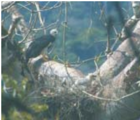
Harpy Eagle and Chick