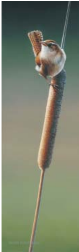
Wren on Cattail