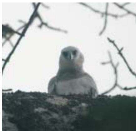
The Harpy "chick" we watched in 2005 is now a juvenile

If you have been a part of this effort, take a minute to pat yourself on the back! The community of Llano Bonito thanks you. Your kindness and generosity has made a real difference in their lives.