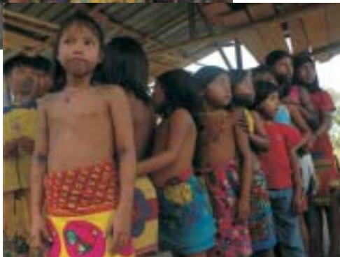
Llano Bonito children lining up for their new school supplies