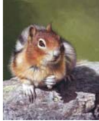
"Golden-Mantled Ground Squirrel"