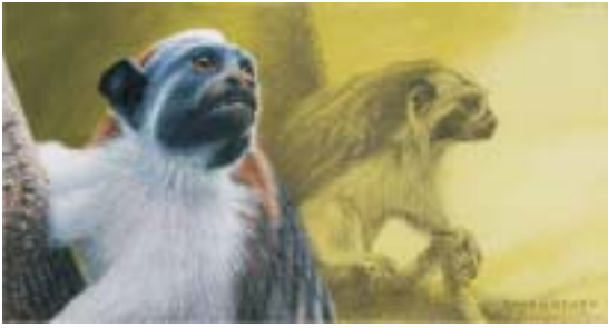
"Watchful Gaze - Geoffrey's Tamarin"