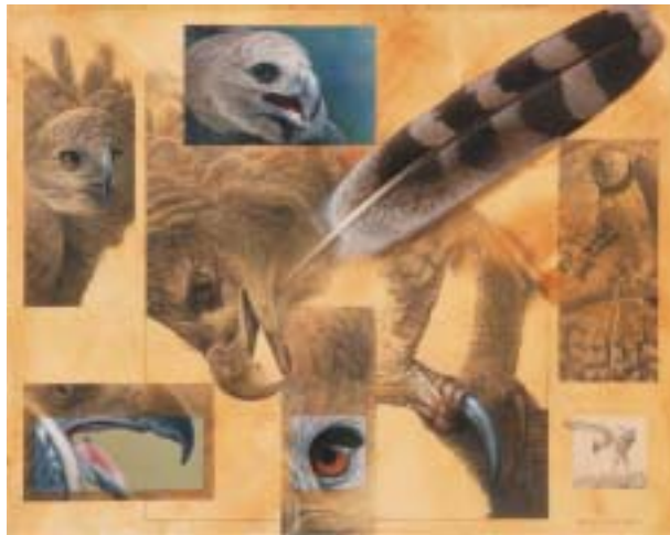
"Harpy Eagle Montage"