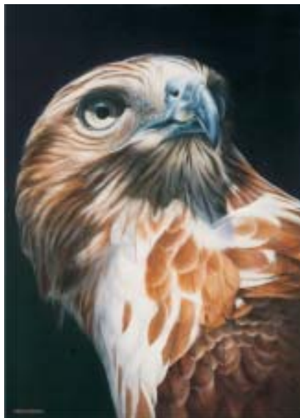
"Larger Than Life - Red-Tailed Hawk"

More than 7,000 people from across Canada (and from several countries around the world) participate in and/or sponsor Birdathon in May of every year. During a 24-hour period they attempt to find as many bird species as they