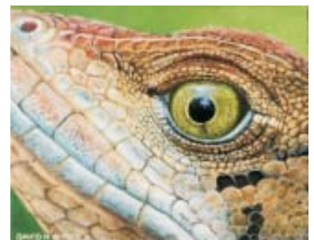
Detail from "Eye Series I"