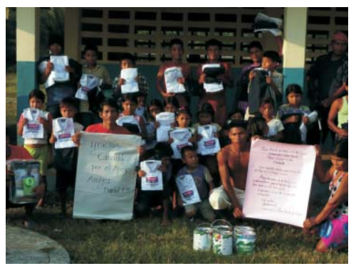
A big "Thank You" from the children of Llano Bonito

In April 2008, once again with the logistical support of Advantage Tours (www.advantagepanama.com), another