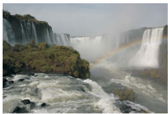
Iguassu Falls, Brazil

Some of the more exciting things you will do include: a visit to Iguassu Falls and the largest remaining area of sub-tropical forest that surrounds the falls; staying at a lodge in the Amazon jungle that has been