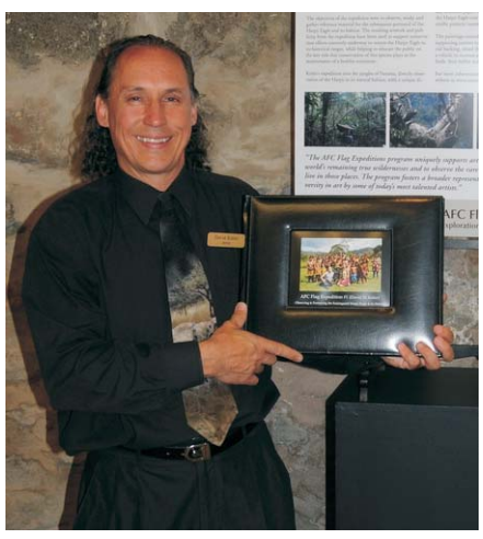
Flag Expedition Journal Collector's Edition

To read about the AFC Program, visit www.natureartists.com/flagexpeditions.