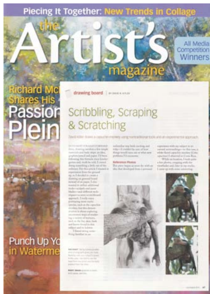
The Artist's Magazine - Jul/Aug 2010