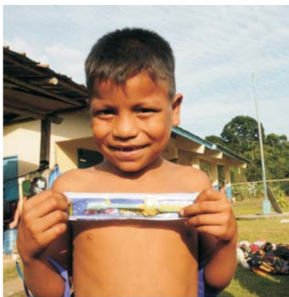
Boy in Llano Bonito happy with a new toothbrush